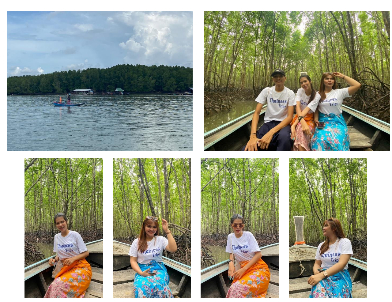
11.20 a.m. And we'll have lunch at Kanab nam View Seafood restaurant. It's a popular restaurant in Koh Klang

Inside the cave of Khao Khanap Nam, there are beautiful stalactites and stalagmites. Ancient human skeletons were once discovered in this cave. It is assumed that these may be the skeletons of a group of people who migrated here and settled down, who probably died in the flood.